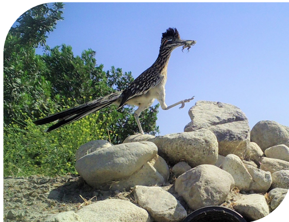
Greater Roadrunners have made guest appearances on the trail cameras several times, often with a lizard in their mouth.

If you are a mouse, this is the last thing you want to see! BUOW landing on the camera.