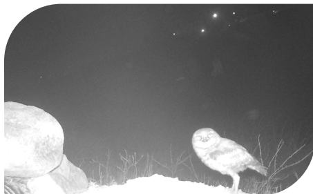
Thanks to infrared capabilities, the cameras record night activity too.