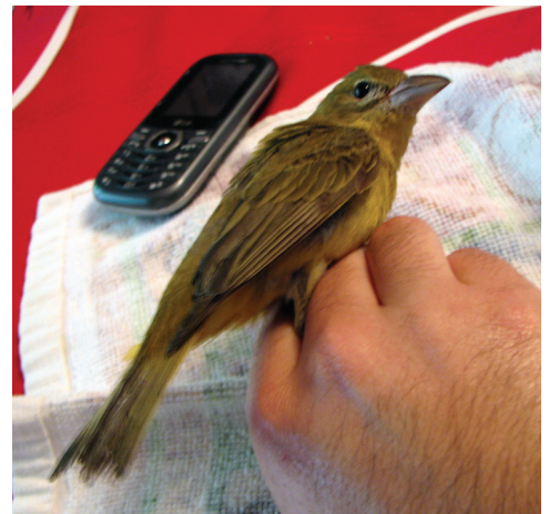
The surprise Summer Tanager recovering from his window collision on Count Saturday.

Totally unexpected was an Summer tanager which flew into a window the day after our count. It was picked up alive by one of our members, photographed for documentation and subsequently released. The bird was still feeding contentedly in the backyard berry bush an hour later.