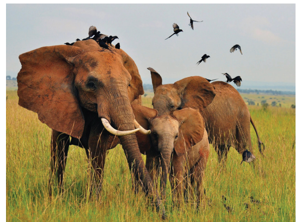
Elephants are often plagued by oxpeckers which feed on the tick and insect pests and even the elephants..